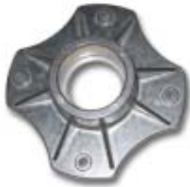
Product Modle: Zamak casting