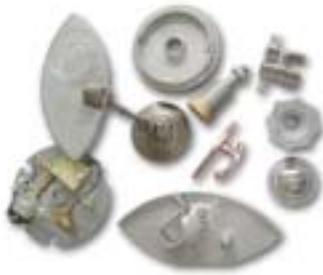
Product Modle: Zinc die casting