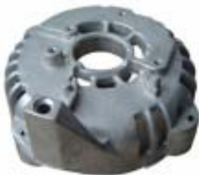
Product Modle: Zinc Aluminum Die Casting