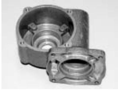
Product Modle: Zinc alloy casting