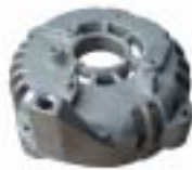
Zinc Aluminum Die Casting