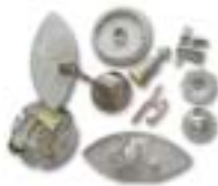
Zinc die casting