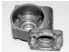
Zinc alloy casting