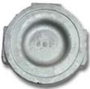
Product Modle: Valve Wedge