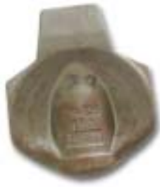
Product Modle: valve wedge casting