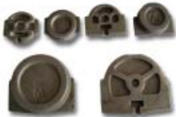
Product Modle: Valve discs