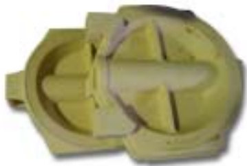
Product Modle: Weldge castings wax mould