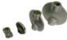
Butterfly Valve discs