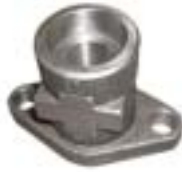
flanges for linking