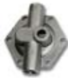
Oil pipe joints