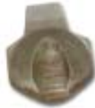
valve wedge casting