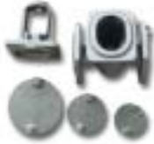
Valve spare parts disc body and bonnet