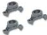
Pipe fittings-link castings