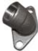
Flange .CNC machined-02