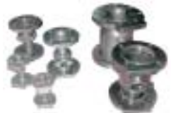
Valve parts castings