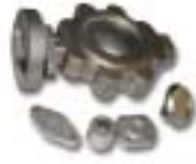
Butterfly Valve casting spare parts