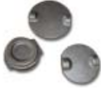
butterfly valve disc