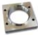
square Flange machined