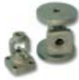
Valve castings body and bonnet