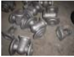
Valve body casting