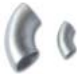
elbow pipe fittings