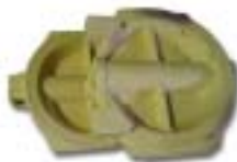
Wedge castings wax mould