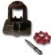
Valve castings hand wheel