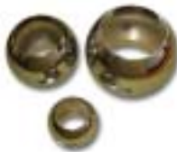
Valve ball DN50 DN80, DN 100