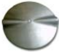
Stainless steel butterfly valve disc valve plate