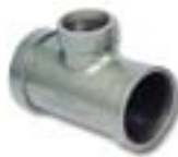
Pipe fittings tee casting