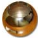
DN 100 chrome plated ball