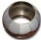
Stainless steel valve ball