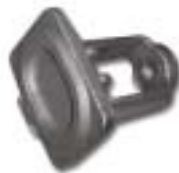
Valve bonnet casting