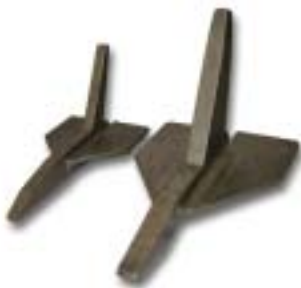
Product Modle: Earth moving castings