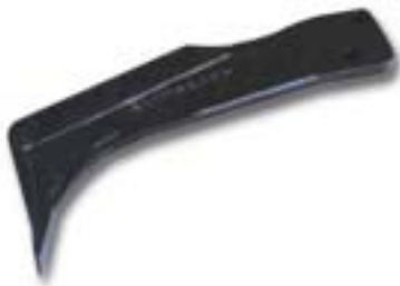
Product Modle: colter earth moving castings