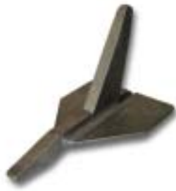
Product Modle: Earth moving casting