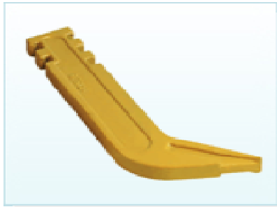
Product Modle: Earth moving parts