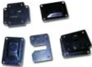
Product Modle: Stamping part-02