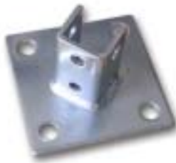
Product Modle: Stamping part-01