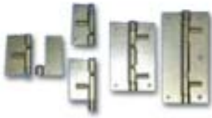
Product Modle: Hinges