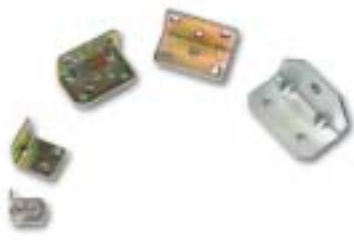
Product Modle: Door hinges