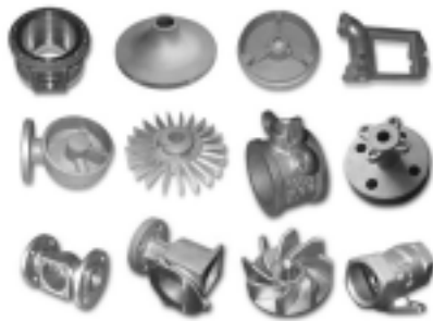
Product Modle: valve spare parts