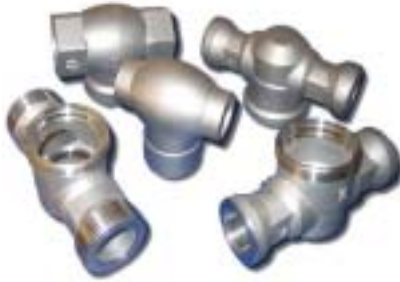
Product Modle: stainless steel pipeline fittings