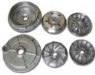
Product Modle: Stainless steel pump castings CNC machined