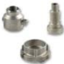
Product Modle: valve spare parts-2