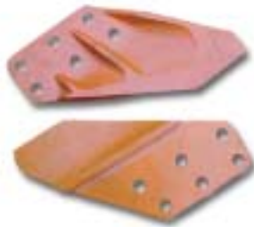
Product Modle: Sider cutter casting parts