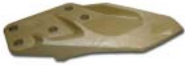
Product Modle: Side teeth-01