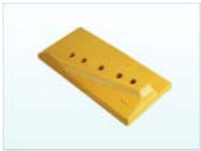
Product Modle: Side cutters