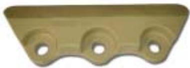
Product Modle: Side teeth-02