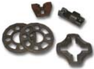
Product Modle: scaffolding spare parts connection discs rapid