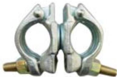
Product Modle: Swivel Coupler