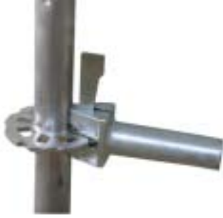
Product Modle: Scaffoldings