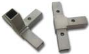
Product Modle: Tee joint connector casting