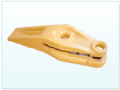
Product Modle: Ripper shanks-03