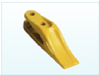
Product Modle: Ripper shanks-05