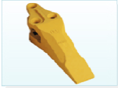
Product Modle: Ripper shanks-04