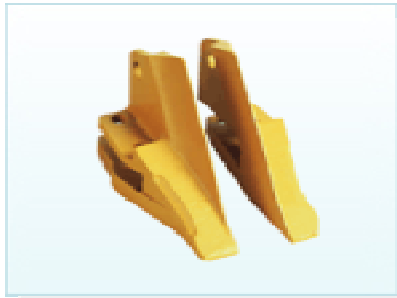
Product Modle: Ripper shanks-06