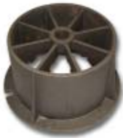
Product Modle: Pump body castings