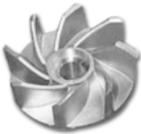
Product Modle: Pump wheel