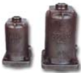
Product Modle: Pump body