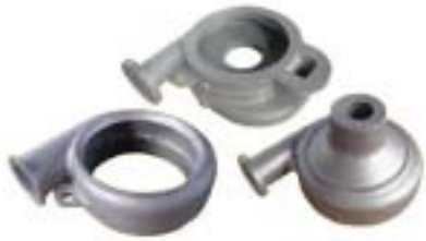
Product Modle: pump body parts