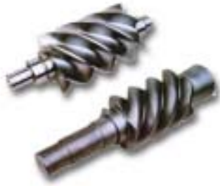
Product Modle: Screw transmission shaft