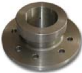
Product Modle: Flange Machined castings