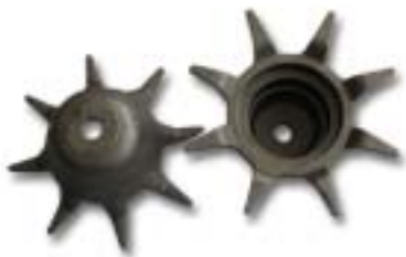
Product Modle: ratchet wheel