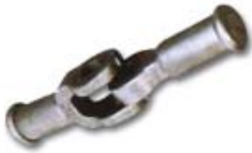
Product Modle: parts for power transmission