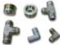
Machined forged parts pipe fittings