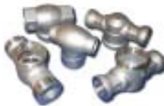
stainless steell machined castings