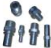
Steel machined parts pipe fittings with zinc plate