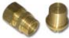
Brass machined parts