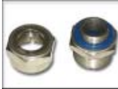
Brass machining parts with chrome plated