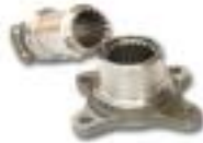
CNC Machined castings