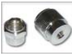
Brass machining parts with plating