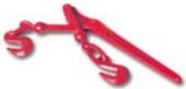
Product Modle: Marine attachments ratchet type load binde