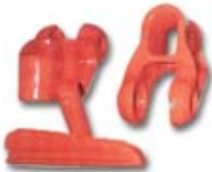
Product Modle: rigging parts