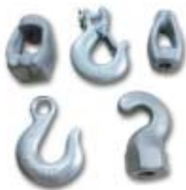
Product Modle: Forged clevis slip hooks hot galvanized