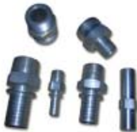
Product Modle: Steel machined parts pipe fittings with zinc plate