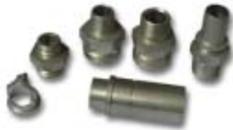
Product Modle: Steel machined parts with zinc plated pipe joints