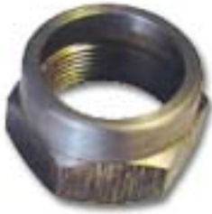
Product Modle: Nuts