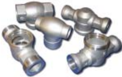
Product Modle: stainless steell machined castings