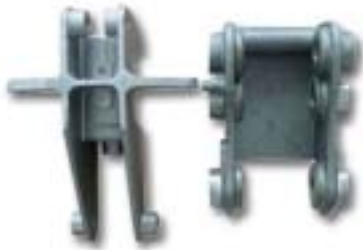
Product Modle: Arm Link castings