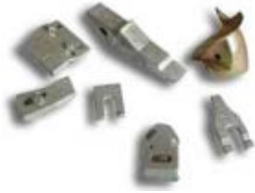
Product Modle: Mining Machining spare parts