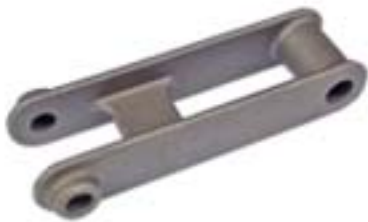
Product Modle: link casting-01