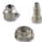
valve spare parts-2