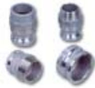
Stainless steel castings with CNC machining