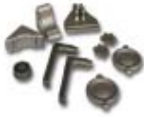
Industrial stainless steel castings