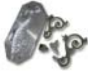
Mould and wax patterns