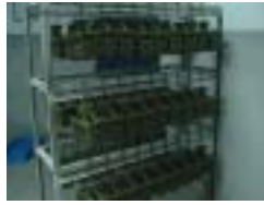
wax pattern welding