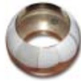
Polished casting parts stainless steel ball