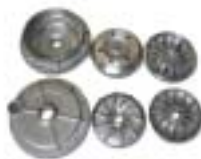
Stainless steel pump castings CNC machined