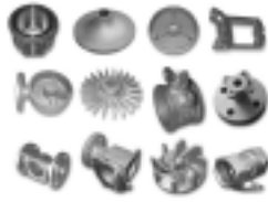
valve spare parts