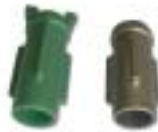
Non magnetic stainless steel casting for electron