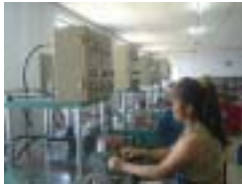
Wax injection machine