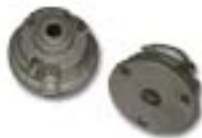
Precise stainless steel castings