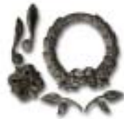
Stainless steel investment castings Door hardware