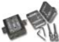
stainless steel casting mould