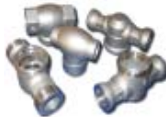
stainless steel pipeline fittings