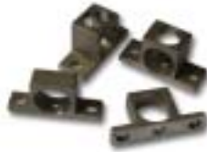
Stainless steel castings feet