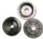
stainless steel castings Pump parts