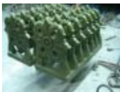
Wax pattern tree