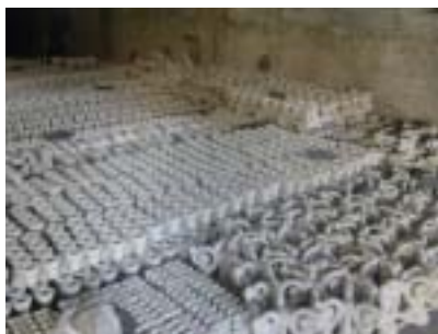
Product Modle: Shells