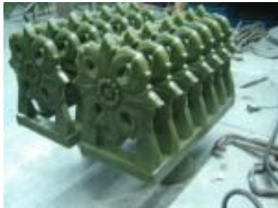
Product Modle:Wax pattern tree