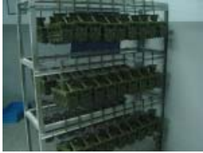
Product Modle:wax pattern welding