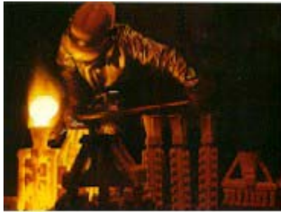
Product Modle: Melting furnace