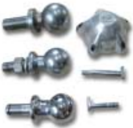
Product Modle: Automobile forging hardwares