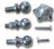
Automobile forging hardwares