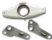
lifter castings arm and base