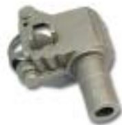
hydraulic body casting for Lifter