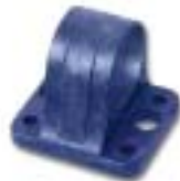
Hydraulic Bearing seat