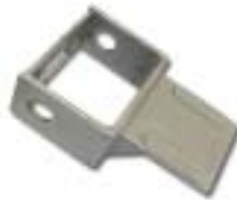
Housing casting for connection