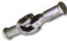
parts for power transmission