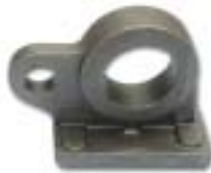
Bearing seat casting