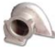
pump body casting