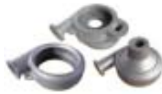
pump body parts