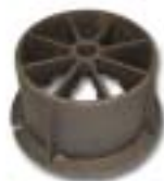
Pump body castings