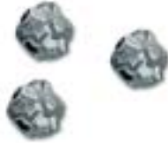
Motor casting for hydraulic