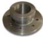
Flange Machined castings