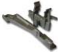
Scaffold spare part brackets