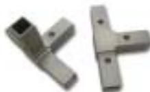
Tee joint connector casting