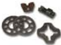
scaffolding spare parts connection discs rapid