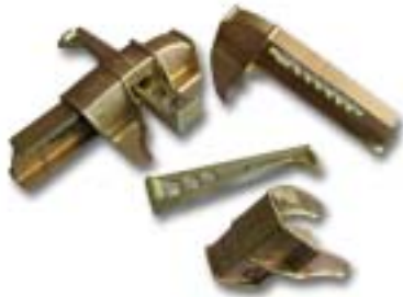
Product Modle: Construction attachments