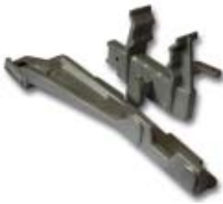
Product Modle: Scaffold spare part brackets