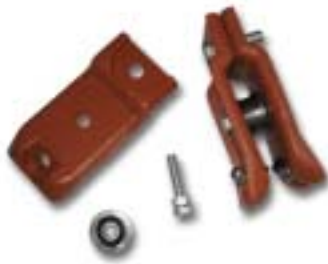
Product Modle: Construction parts