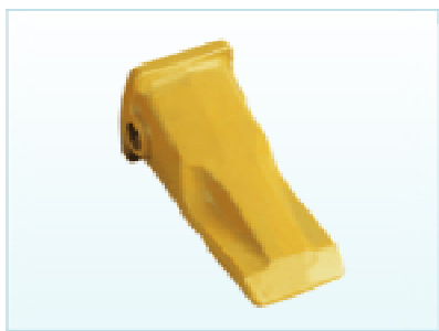
Product Modle: Bucket teeth-14