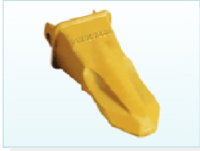
Product Modle: Bucket teeth-13