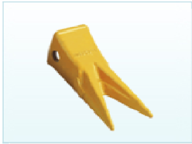
Product Modle: Bucket teeth-15