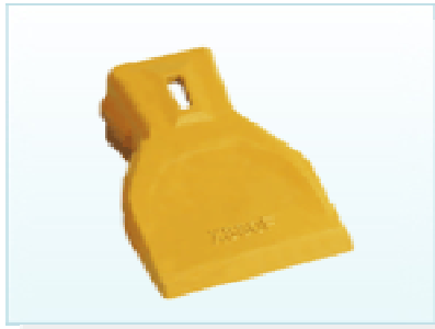
Product Modle: Bucket teeth-12