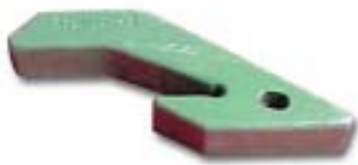
Product Modle: Adaptor-09