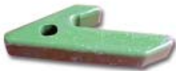
Product Modle: Adaptor-11