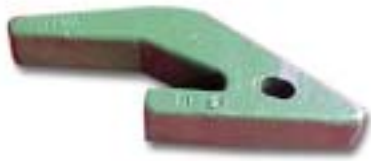
Product Modle: Adaptor-12