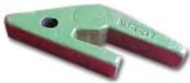
Product Modle: Adaptor-10