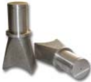
Product Modle: Machined castings support axis