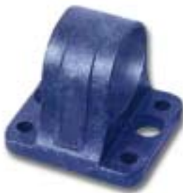
Product Modle: Hydraulic Bearing seat