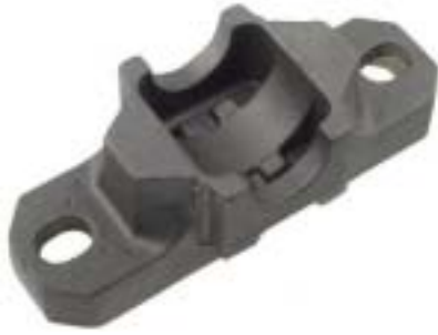
Product Modle: Bearing seat