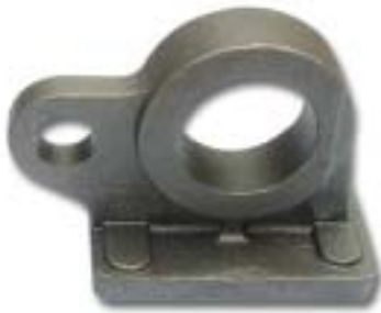
Product Modle: Bearing seat casting