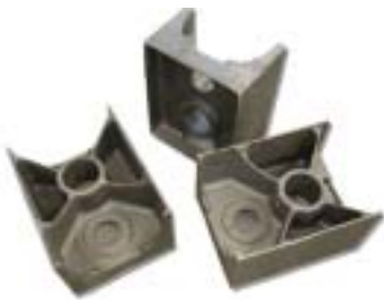
Product Modle: Housing castings