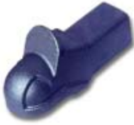
Product Modle: coupler support ball connection casting