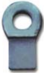
Product Modle: Coupler lug for automobile