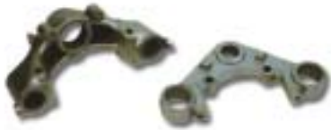
Product Modle: Motorcycle casting