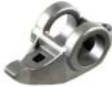
Automobile Component Casting