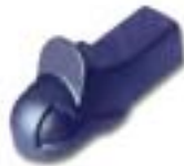
coupler support ball connection casting