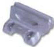
Container spare parts seat