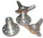
Spinner and Adaptor forged