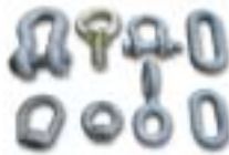
D rings and O rings