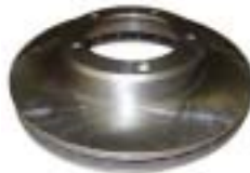
Brake plate brake disc