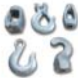
Forged clevis slip hooks hot galvanized