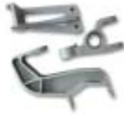
railroad castings bracket