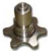
sprocket wheel with CNC machining