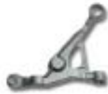
Yoke bracket for automobile