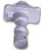
Container handle attachments galvanized