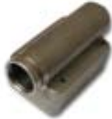
Stainless steel Automobile casting