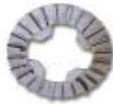
Brake disc for automobile