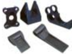
Hinge and housing castings