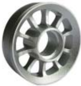
Product Modle: Alum alloy casting