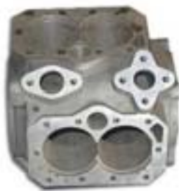
Product Modle: Alum alloy casting with macinated